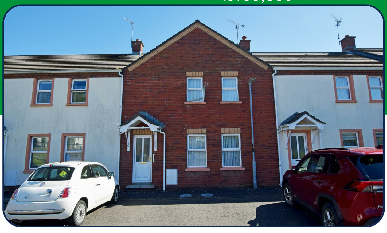
42 Beresford Avenue, Coleraine, BT52 1HJ