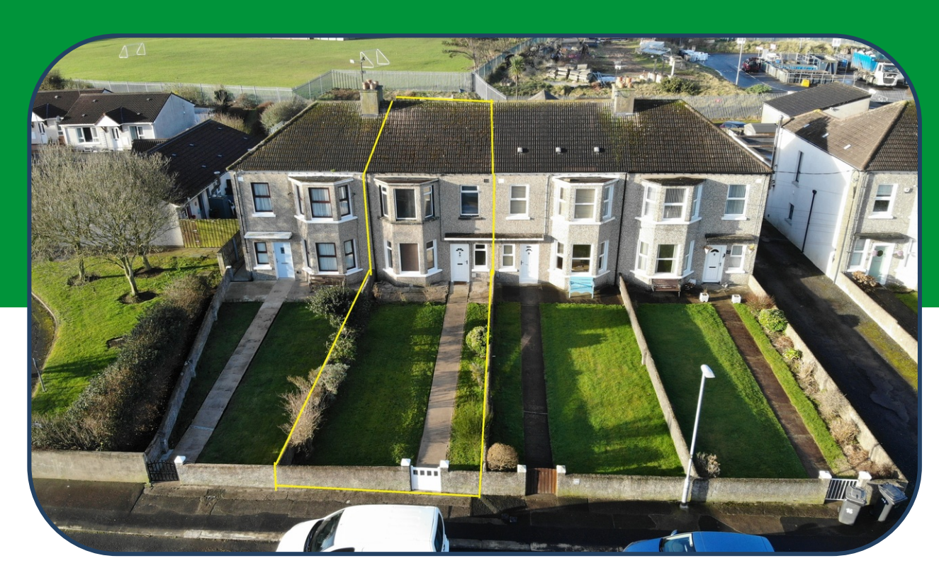
166 Causeway Street, Portrush, BT56 8JE