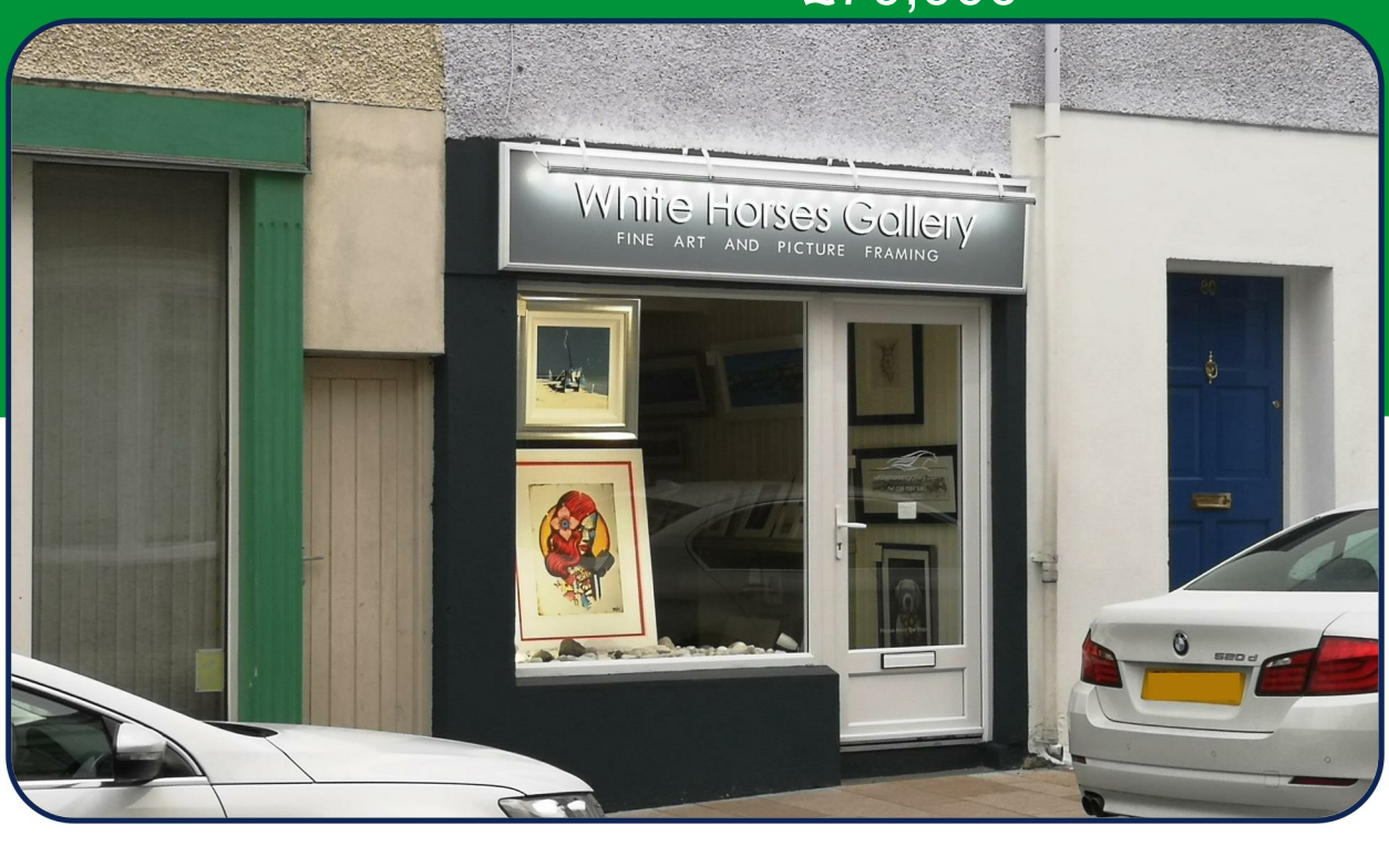
82 Main Street, Portrush, BT56 8BN