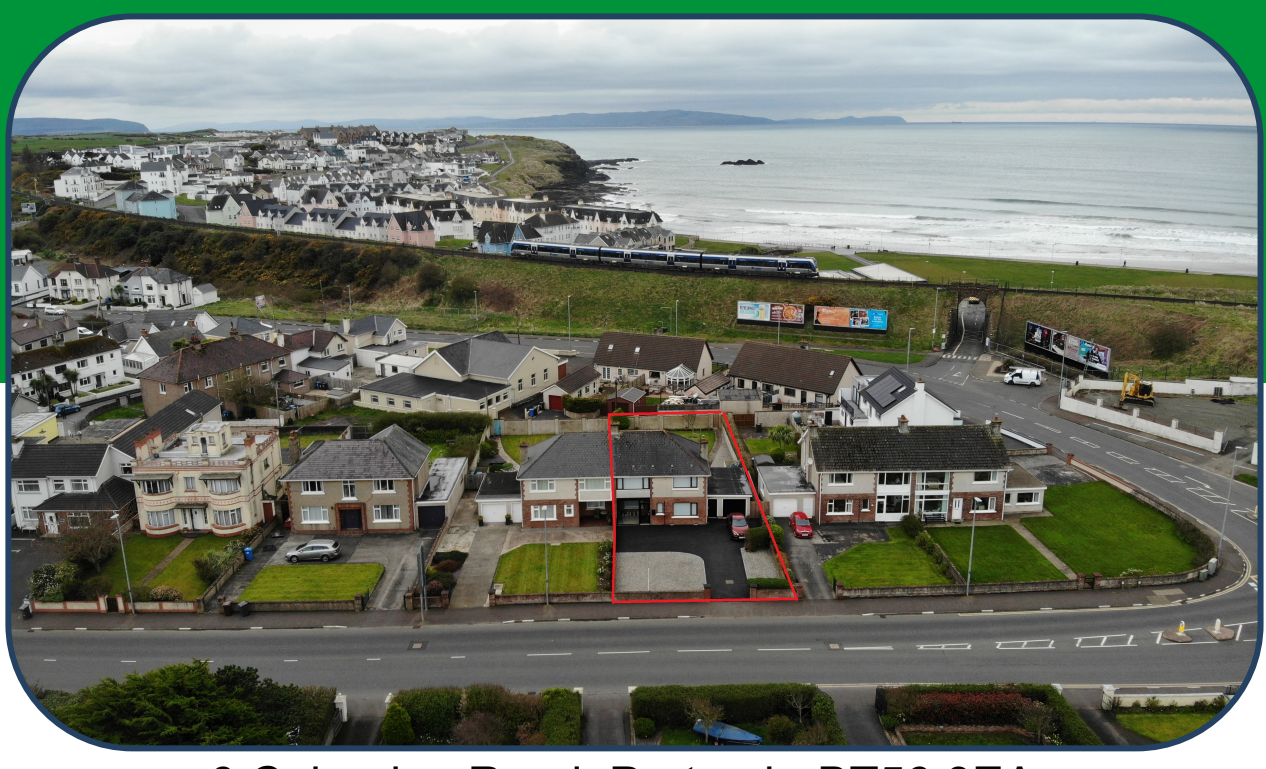
6 Coleraine Road, Portrush, BT56 8EA