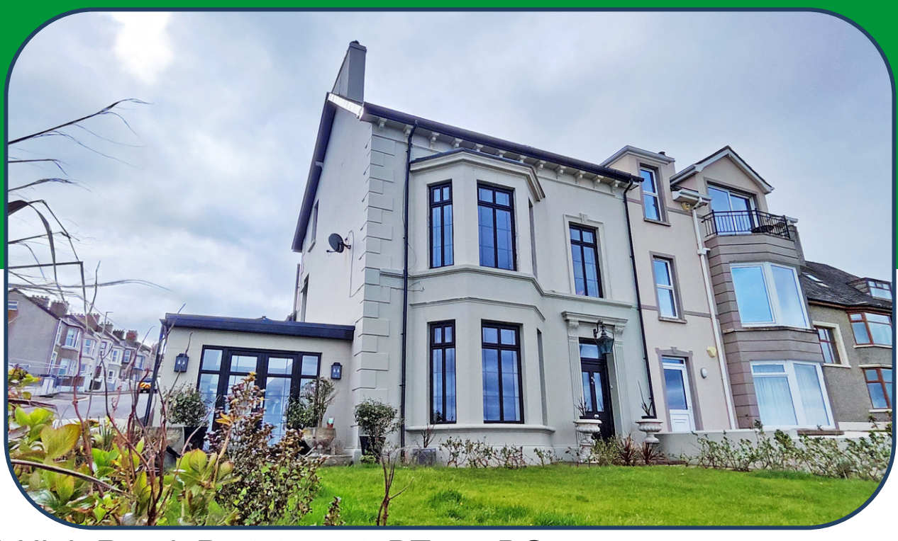
31 High Road, Portstewart, BT55 7BG